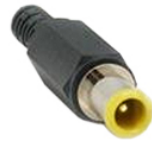
EJ1/2/3/4/5 (EIAJ RC-5320A type connectors)