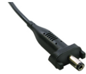
Inquire for custom design

For a comprehensive list of options, click here