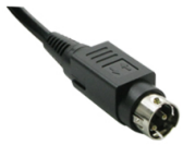
YL3 Type (KPPX-3P)