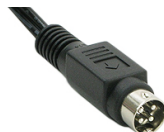
YL4 Type (KPPX-4P)